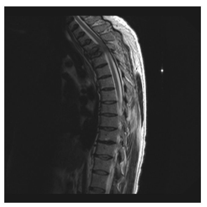
Figure 1. Sagittal T2 weighted MR imaging scan demonstrating T2 vertebral compression fracture, narrowing of the spinal canal and cord compression.

Bone is a common site of metastasis in lung cancer. It is reported that 30–40% of patients who have lung cancer will develop bone metastases during the course of their ailment [2]. The thoracic vertebrae are the most frequently involved sites, representing 70% of cases [3]. It is reported that 60–70% of patients with systemic cancer develop spinal metastasis, although only 10% are symptomatic [4]; 15.6% of symptomatic